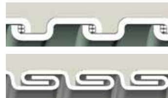
Square-Locked Design with cord packing 3/8" - 1"

See: www.ul.org www.nfpa.org www.naed.org www.nema.org www.anacondasealtite.com