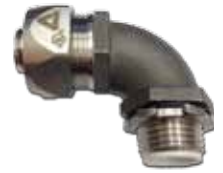
90° - NPT Thread 3/8" through 1"